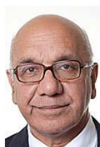
Mr Virendra Sharma MP Chair

The APPGDS is run by and for Members of the House of Commons and House of Lords and its key officers are: