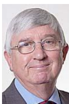
Dr Hywel Francis MP Vice-Chair